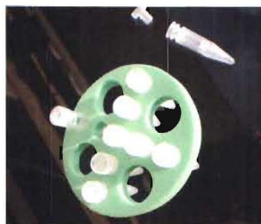
Mini GeBAflex-tube & float