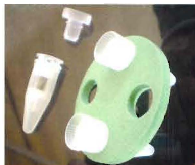
Midi GeBAflex-tube & float