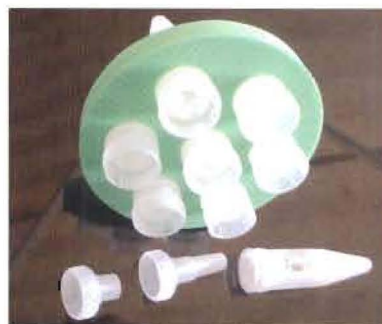
Maxi GeBAflex-tube & float. with 2 and 3 ml cap