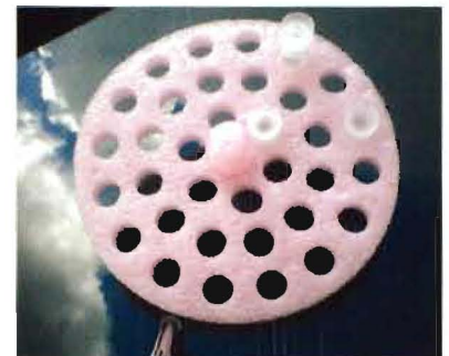
Single float T002-35 can process upto 35 Midi GeBAflex-tube in a single beaker

High through put dialysis & buffer exchange